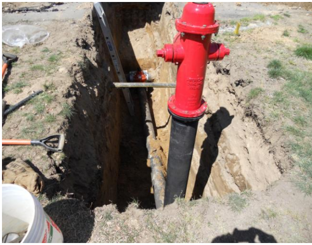
A recent Water Department project on Mosier St. during which 700' of old 6" water main was abandoned and connections were made to a newer 8" line.