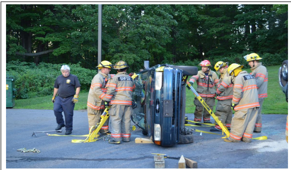
District No.2 Firefighters participating in a vehicle extrication/stabilization drill. Firefighters and EMTs attend trainings several times each month. In this drill personnel are working with our new Res-Q-Jack system.