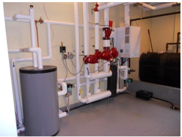
In 2012 Todd Calkins worked with outside contractors to replace the original 1960's heating system (left) in the District 2 building with a modern high efficiency system (right).