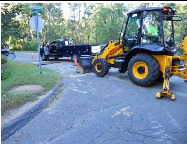
The Water Department working on an interconnection on the water mains on Jewett Lane and Buttonfield lane.